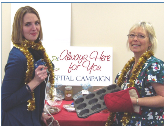
Hospital staff join in with fundraising activities with their 2-Day Bake and Craft Sale. The concept worked well given the shift work at the hospital. We await the next venture!

How does a delay like this affect us at the Campaign? Actually, not much at all because we still have to proceed and accumulate commitments to the